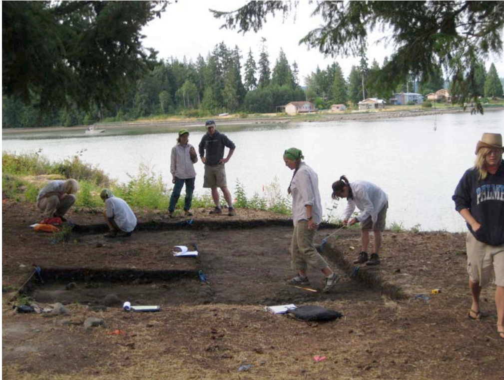
Figure 1- Excavation at Kleh Kwa Num or Scuttle Bay (DISd-6)

We then employed the following general excavation methods: the site was excavated in 10 cm arbitrary levels in case changes in cultural or natural layers were not visibly apparent as we excavated horizontally. When there was a distinct change in the matrix within the 10 cm levels, the material from it was bagged and recorded separately. We screened the recovered sediment using 1/8 th inch screen. This method, in particular, allowed us to collect small faunal remains, especially herring ( Clupea pallasii ) and salmon ( Oncorhynchus sp. ) bone. In addition, we used floatation methods to collect material, including fish bone from the heavy fraction. We mapped the entire site using a total station, which was also used to record the location of artifacts found in-situ.