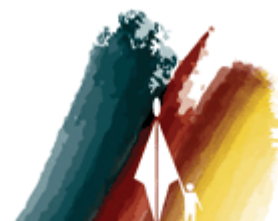
School District #47