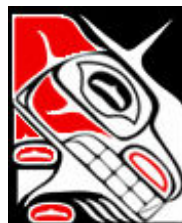
Sliammon Social Development Sliammon Education Sliammon HRSD